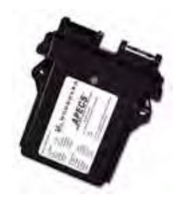
APECS 4500 Controller

Advanced electronics in the APECS 4500 provide maximum control and optimal engine performance. Adaptive features include autocrank, droop governing, glow plug control, and analog input (remote speed pot). CAN / J1939 bus interface allows communication and diagnostics among engine components. The APECS 4500 controller is integrated into commercial and construction vehicles, and industrial engine systems and compressors by original equipment manufacturers.