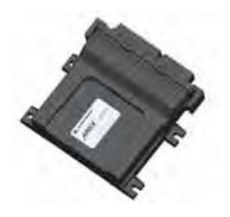
APECS 4800 Controller

The APECS 4800 48-pin digital controller provides isochronous speed control, actuator position control, torque limiting, droop, glow plug control, CAN /J1939 based communications, and additional engine management and protection functions to optimize engine operating efficiency. The 4800 provides NOx control through EGR and particulate control with smoke limiting technology using actuator position feedback control. Torque limiting protects the engine from over loading.